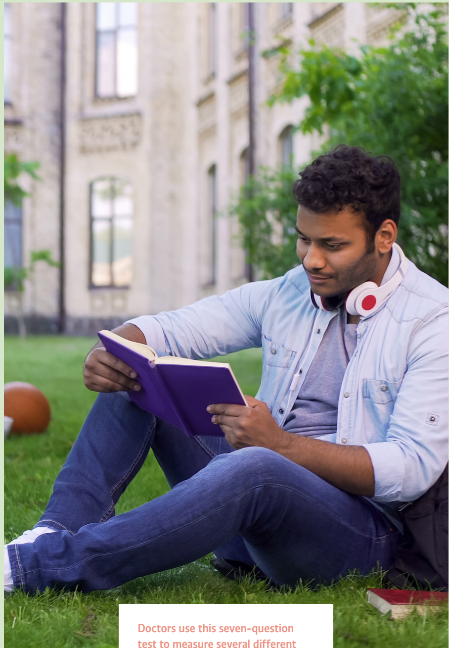
Doctors use this seven-question test to measure several different anxiety disorders.

With a score in this range (or as low as 8 for people with panic disorders, social anxiety, or PTSD), anxiety is probably affecting you every day. It's chasing you, filling your head with worries, and interfering when you're trying to live your life. Some people may not understand the cloud of worries that you're fighting every day, but we